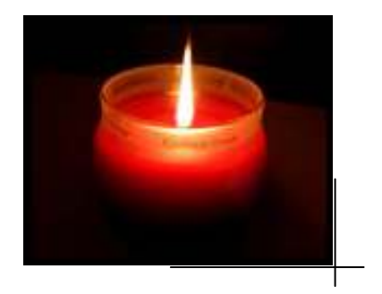
Through rituals, men and women gathered with a better level of self-control than usual, thinking about noble life